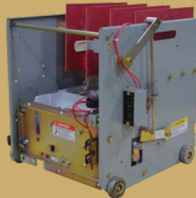
Air to vacuum retrofit