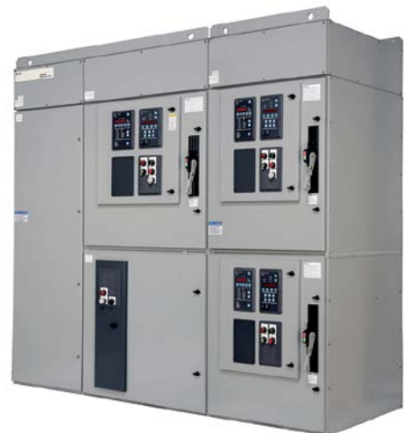
72 kV standard MVC