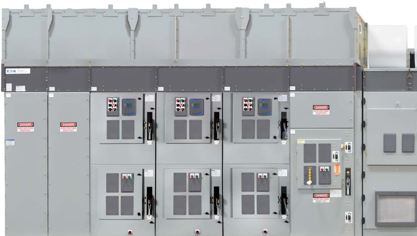
Ampgard AR arc-resistant close-coupled with SC9000 EP arc-resistant drive