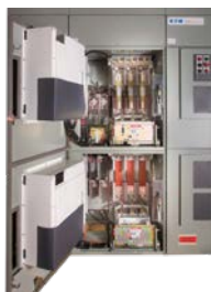
Synchronous transfer with medium-voltage drive