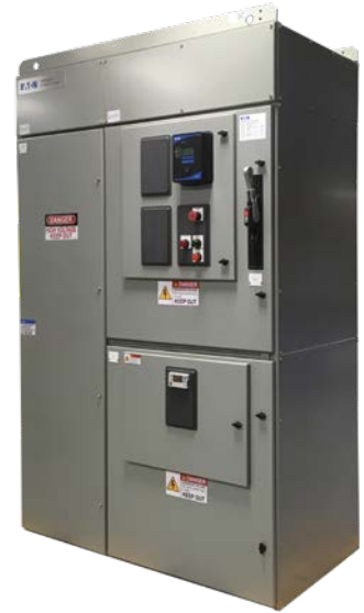
Reduced-voltage solid-state starter