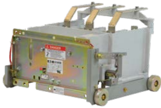
400 A vacuum contactor