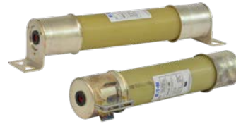
Bolted and clip-in main fuse