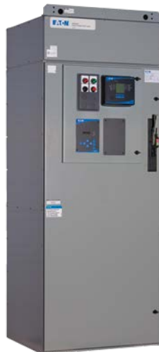
15 kV standard MVC

Eaton has been an industry leader for more than 40 years, providing UL® 347 certified medium-voltage control. When it comes to controlling and protecting medium-voltage motors, the Ampgard™ family is the premier high-performance choice.