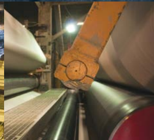
Pulp and paper