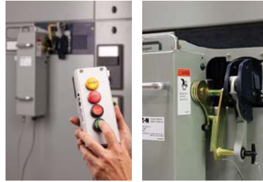
Ampgard remote operator